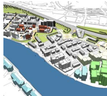
Boathouse Lane Masterplan