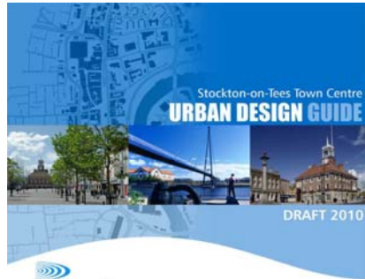
Urban Design Guide – Delivery Strategy