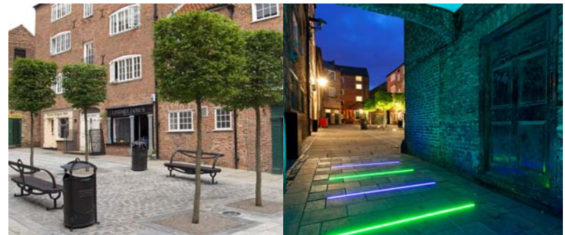
Green Dragon Yard Cultural Quarter