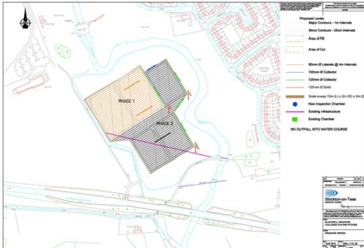
New Football Pitches for Darlington Borough Council