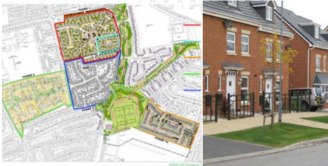
Mandale Housing Renewal