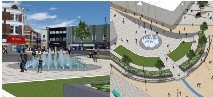
Stockton Town Centre Urban Design Guide