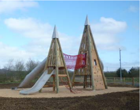
Park Furniture 'Style Guide'