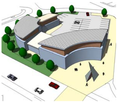
Clarence Street Surgery