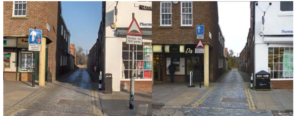
Yarm Town Centre