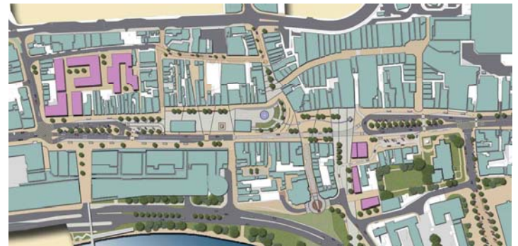
Bus Majors Scheme